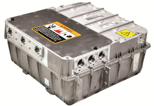
PD550 Single Inverter

The PD550 single inverter is based on high performance DSP real-time embedded software to support advanced features such as field-oriented control. The high-voltage, high-power modules are designed to work at maximum efficiency with complete monitoring capabilities to ensure control under all conditions. The thermal management system is liquid-cooled for robust and reliable performance over the life of the system.